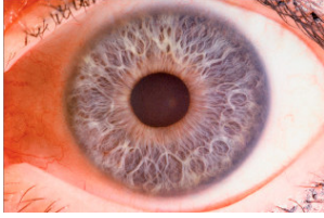
Weak Genetic Constitution