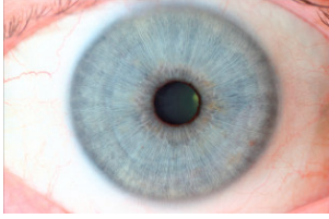
Strong Genetic Constitution

“REMEMBER...GOOD HEALTH IS YOUR CHOICE.”™